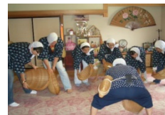
Traditional local dance: Dojo-Sukui (Fish Catch Dance)